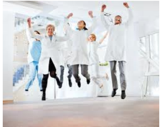
The "Finalization" stage includes quality assurance, final imports, final approvals, workflow modifications, and training. Each stage contains specific project milestones that must be completed before progressing to the next stage.